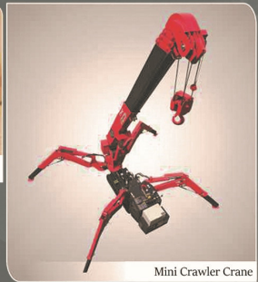
Mini Crawler Crane