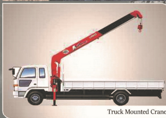
Truck Mounted Crane