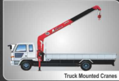
Truck Mounted Cranes