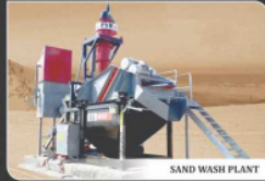
SAND WASH PLANT