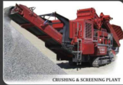
CRUSHING & SCREENING PLANT