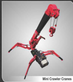
Mini Crawler Cranes